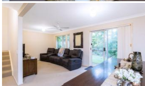
Unit 6, 23 Thorngate Dr, Robina