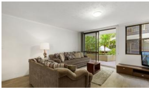
Unit 9A, 3355 Surfers Paradise Bvd, Surfers Paradise